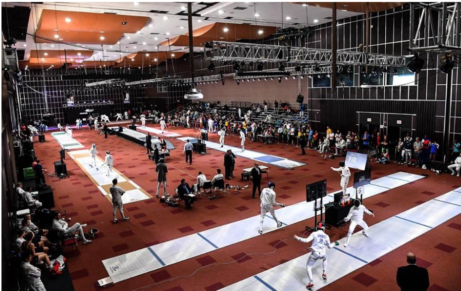
General view to the competition

Cl. 15 #26-120, Arroyo Hondo, Br. Trinidad Etapa 1, Yumbo, Valle del Cauca