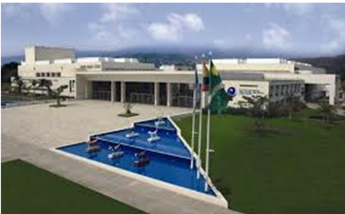
Pacific Valley Events Center's venue