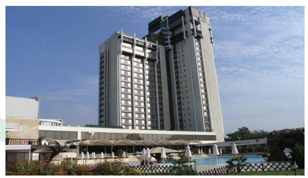
The price for a SIngle Room per night is €70 The price for a Double Room per night is €90

The price for a SIngle Room per night is €70 The price for a Double Room per night is €95