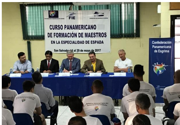
Photo Gallery of the Training Course for the Epee Fencing Teachers Specialty, San Salvador, El Salvador 2017