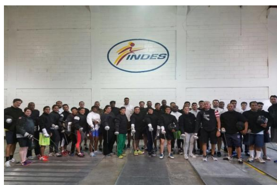
Inauguration of the Course in San Salvador, El Salvador 2017