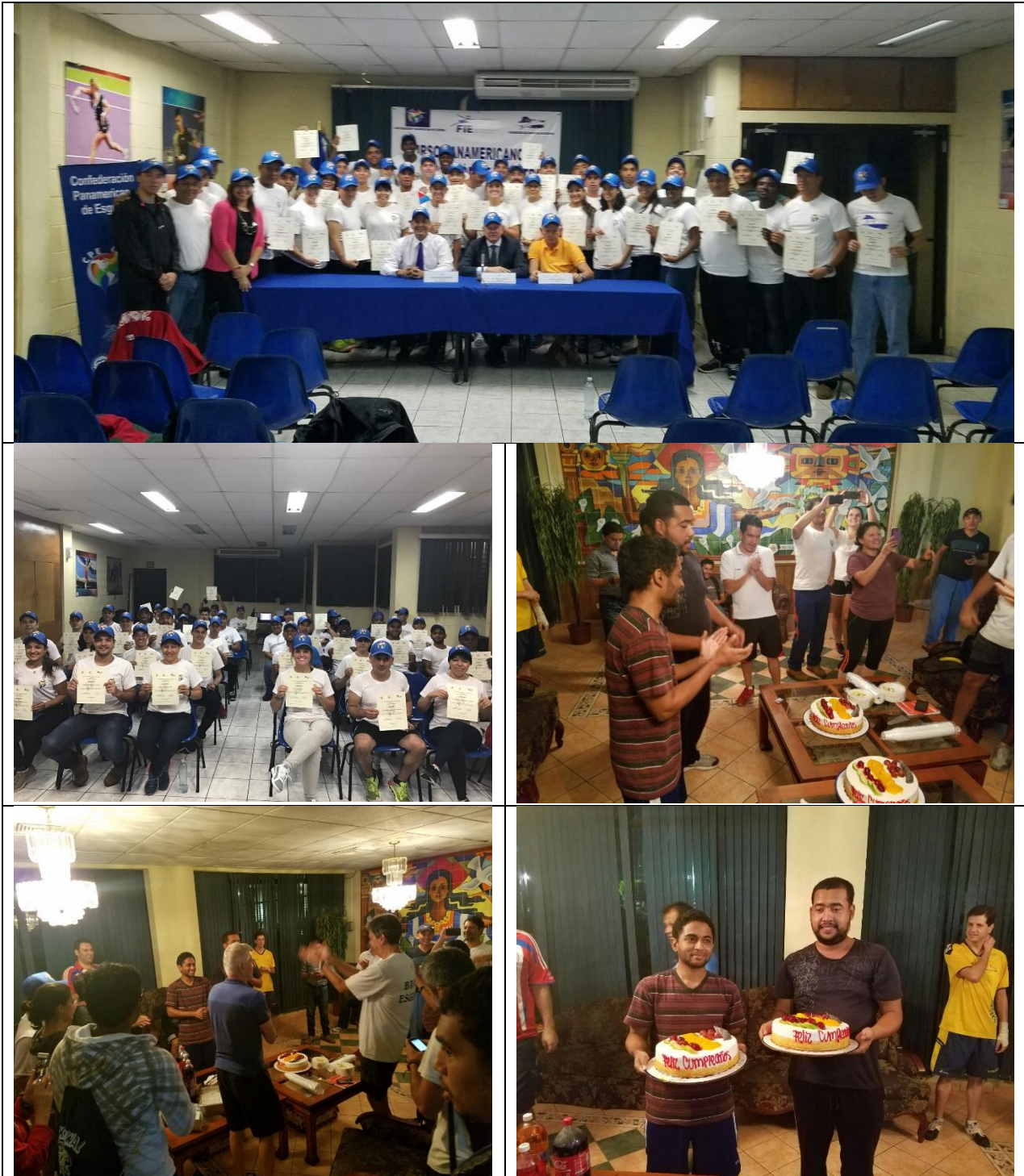
Diplomas Ceremony and friendly convivance of the group