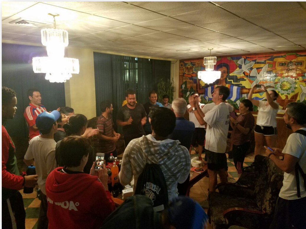
Double birthday celebration among continental friends!

The students in this course were exposed to synergistic aspects between the disciplines of the new curriculum even though the group was integrated in a diverse way between mature teachers and young students, in the search of the promotion of their integral development in all the aspects that will make them more efficient and effective in their practice. In this way, the Pan American Fencing Confederation has begun to teach its new curriculum, motivating new opportunities to create networks for knowledge exchange and friendship from the most austral to the most septentrional regions of the continent.