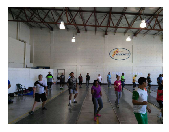
The students attending the class