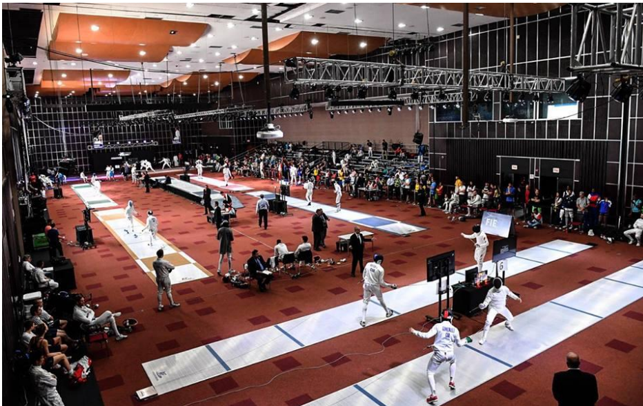
General view to the competition

Cl. 15 #26-120, Arroyo Hondo, Br. Trinidad Etapa 1, Yumbo, Valle del Cauca