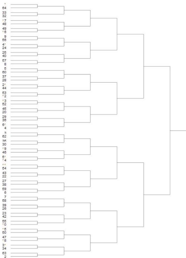
Figure 7a. Bout plan for individual direct elimination (table for 64 fencers)