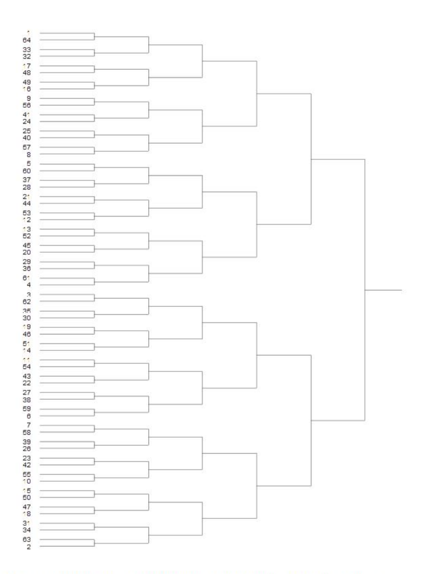
Figure 7a. Bout plan for individual direct elimination (table for 64 fencers)