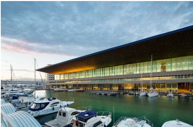
Hall of preliminaries

Address: P.le John Fitzgerald Kennedy, 1 16128 Genova GE Italy