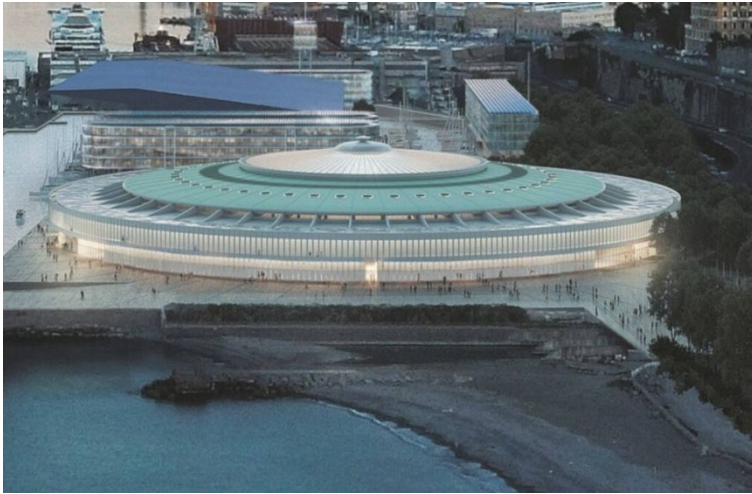
Hall of finals

Address: P.le John Fitzgerald Kennedy, 1 16128 Genova GE Italy