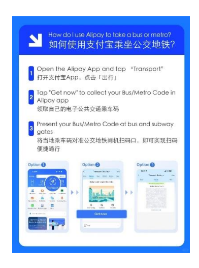
Step 3: Activate QR Code - Generate the QR code at any station gate. - Scan the code at the ticket gate's QR reader (place code under the scanner).

Step 4: Exit & Payment - Scan the same QR code when exiting. - Fare is auto-deducted from your Alipay balance/linked card.