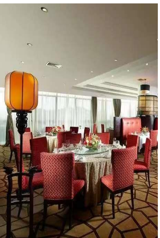
(Songjiang New Century Grand Hotel Shanghai)