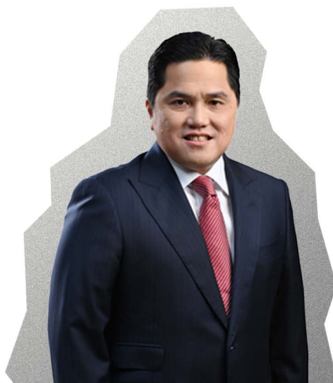
Mr. Erick Thohir Ministry of Youth and Sport of Republic of Indonesia