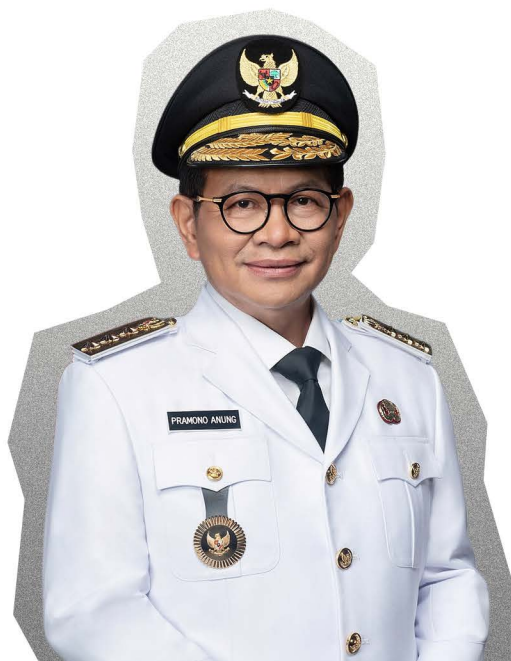
Mr. Pramono Anung Governor of Jakarta