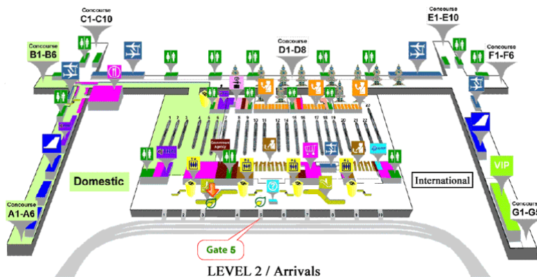
Meeting Point at Suvarnabhumi International Airport

(f) Smoking: Smoking in all air-conditioned public places (including education institutions) is against the law and subject to a 2,000 baht fine. Smoking is also prohibited in all covered areas, including shopping centers, restaurants, cafes and bars (some are allowed to set up special smoking rooms). Smoking is also banned in outdoor eateries, coffee shops, canteens and cafes (some areas are set aside for smoking).