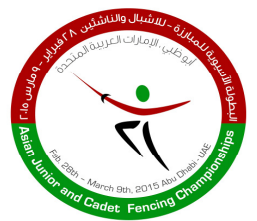
****Hilton Capital Grand, Abu Dhabi