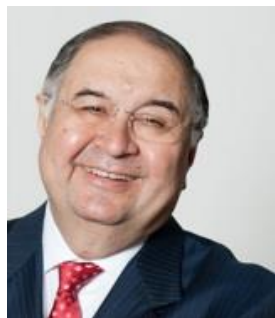
Alisher Usmanov President of FIE