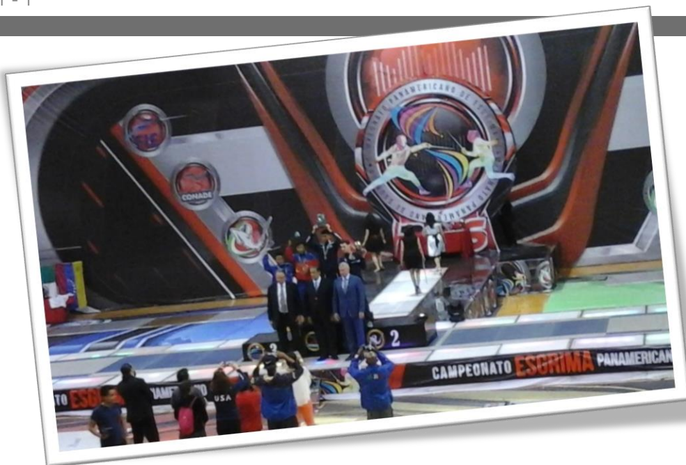
Aspect of an awards ceremony in this Pan American Fencing Championship, Cancún 2016